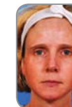
14 Days Post-Op