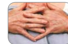
14 Days Post-Op